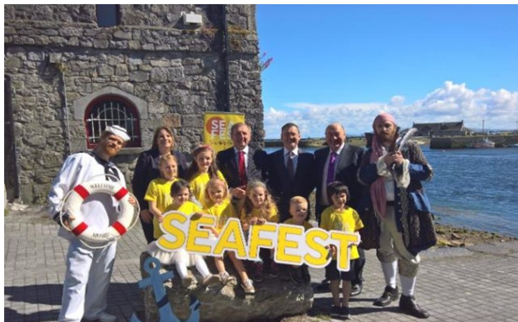
Launch of SeaFest, Ireland's national maritime festival

SeaFest plays a vital role in the Harnessing Our Ocean Wealth's key goal of increasing participation and engagement with the sea. It deepens knowledge and appreciation of the ocean and builds on how we can each work to protect while also benefiting from our abundant maritime resources.