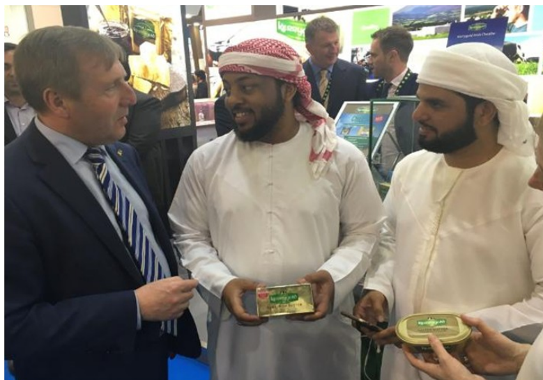
Minister for Agriculture, Food and the Marine, Michael Creed, TD, on a visit to Gulfood, the world's largest agri-food trade fair, where over 20 Irish companies are exhibiting at the Green Pavilion, coordinated by Bord Bia.

This Trade Mission to the Gulf was planned specifically to coincide with Gulfood, which provided Irish companies with an exciting opportunity to showcase the best of their safe, high quality and sustainably produced food and drink, across a range of sectors including dairy, meat, eggs, consumer foods, biscuits and more. I was particularly pleased to see over 20 Irish companies participating in this event showcasing the best of what Ireland has to offer in this sector.