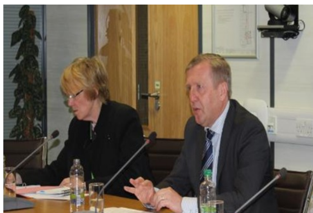
Minister for Agriculture, Food and the Marine, Michael Creed TD, at the fourth All-Island civic dialogue to discuss the implications of Brexit for the agri-food and fisheries sectors.

I want to emphasise the very worthwhile contribution that the dialogue has made to my own and to the Department's preparations for Brexit. I look forward to further engagement with stakeholders as the negotiation process unfolds over the coming months.