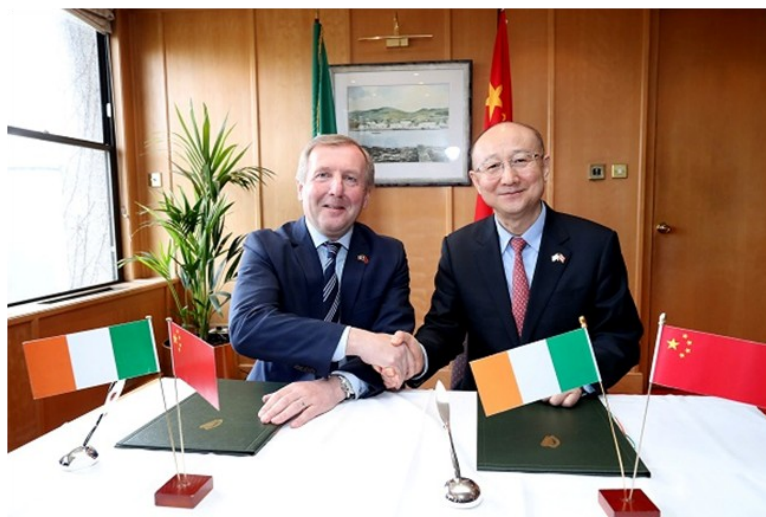
Minister for Agriculture, Food and the Marine, Michael Creed TD, made a number of significant advances in the development of Irish exports of beef, seafood and thoroughbred horses to China, during a meeting with Chinese Minister Zhi Shuping.