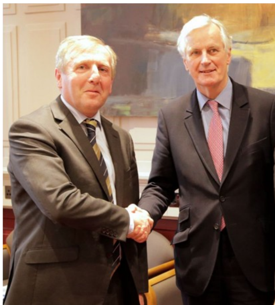
Minister for Agriculture, Food and the Marine, Michael Creed TD meets EU's chief Brexit negotiator Michel Barnier.

Over the past number of months, I have travelled to a number of Member States including, Denmark, France, Poland and the Netherlands, and I have also held bilateral meetings in the margins of the monthly Agriculture & Fisheries Council of Ministers meetings, with my EU colleagues and the Commissioner, specifically to discuss Brexit and the potential implications for the agri-food & fisheries sectors here in Ireland.